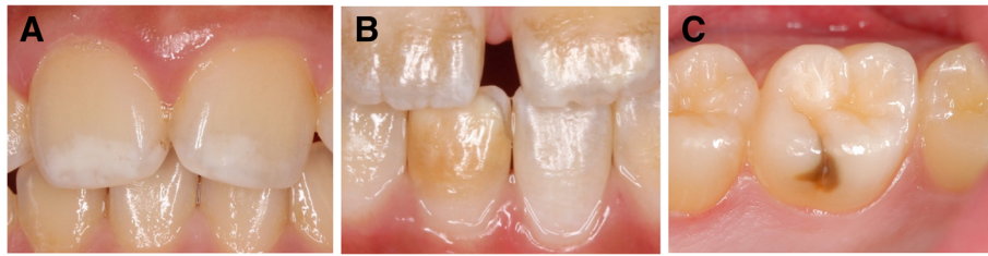
Fig. 1 Tooth discoloration in a child with MIH was graded according to the color shade as follows: a white opacity, b yellow/brown opacity, and c dark brown opacity

invited to participate. Of these, 489 children had incomplete data. Thus, 4496 (90.2%) children were included in the analyses. There was no significant difference according to sex (boys—2216, 49.3%; girls—2280, 50.7%). The overall prevalence of MIH in Japan was 19.8% (892/4496). Tooth surface defects were found in 8.1% (366/4496) of subjects. A summary of subjects' characteristics is shown in Table 1.