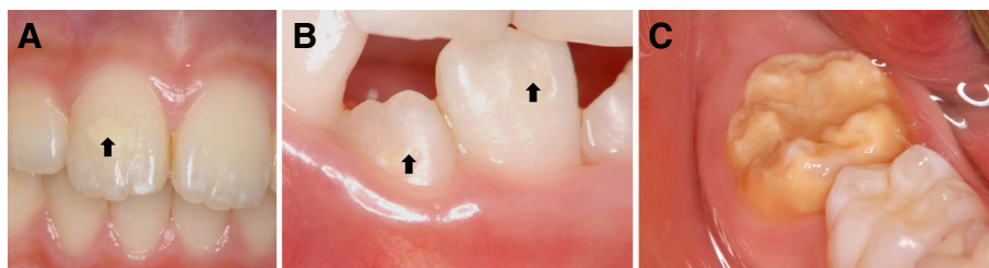
Fig. 2 Tooth surface defects were categorized as follows: a none, b enamel defect, and c dentin defect

MIH was more prevalent among participants in southwestern areas (Kinki, Chugoku, Shikoku, and Kyushu) than those in northeastern areas (Hokkaido and Tohoku) of Japan. These regional differences could generate hypotheses for the analysis of the etiology of MIH in Japan. Many potential causes of MIH have been proposed, such as prematurity, viral or bacterial infections, respiratory diseases, asthma, and frequent episodes of fever in early childhood or mothers who experienced problems during pregnancy [7, 17]. However, these possible causes do not explain the regional differences in Japan. One potential explanation may be serum 25-hydroxyvitamin D concentrations in children or their mothers. Osteoporosis also occurs more frequently in southwestern areas than northeastern areas of Japan [18]. Patients with osteoporosis have low serum 25-hydroxyvitamin D concentrations [19]. Increases in serum 25-hydroxyvitamin D concentrations are significantly associated with a lower odds ratio of having MIH. Furthermore, higher serum 25-hydroxyvitamin D levels are related to a lower number of caries-affected permanent teeth [20]. Endogenous vitamin D 3 is synthesized in the skin through